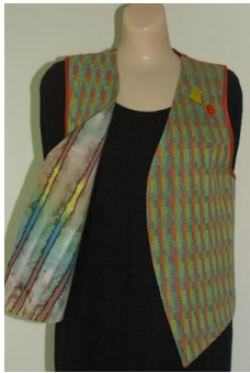
Overshot on 4 shafts 512 ends per repeat!